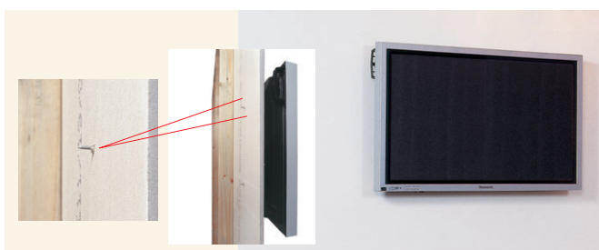
Screw fix directly to the Powerscape® Confidence™

In tests carried out to current and proposed international standards, new Powerscape Confidence Ultra-Mesh made a clean sweep for toughness and impact resistance. Powerscape Confidence Ultra-Mesh was rated highest in both hard and soft body impact tests, and in joint strength. The tests compared Powerscape Confidence with both fibre cement and plasterboard.